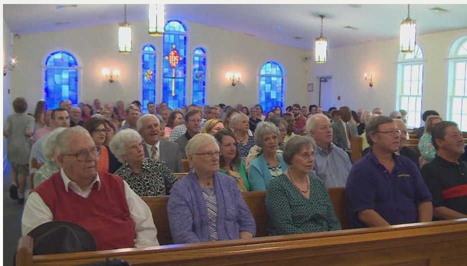
Hollywood Church E.P.C. 75th Homecoming

From Hollywood Community School to Hollywood Church, EPC, we have a rich heritage, and many wonderful people have helped make it a reality.