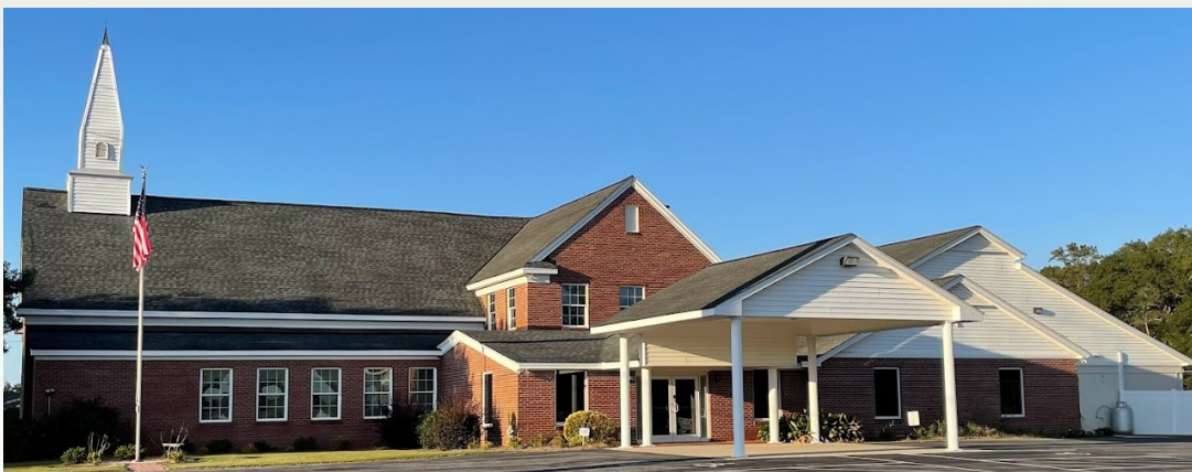
Church facility viewed from the southern parking lot. (current view)