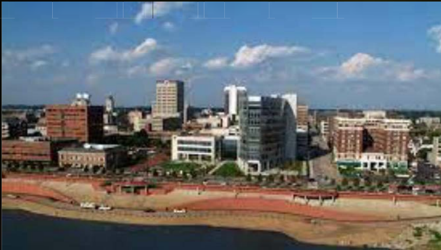
Evansville Living ( https://www.evansvilleliving.com/ )

Evansville is Indiana's third largest city after Indianapolis and Fort Wayne, and the largest city in Southern Indiana. Evansville is the social, medical, and cultural hub of activity in southwestern Indiana and the Illinois-Indiana-Kentucky tri-state area. This region is home to over 300,000 people. There are some key initiatives underway in our community that we believe reflect the movement of the Spirit of God in our midst.