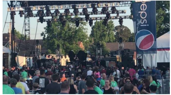
A scene from our community's annual Herrin Festa