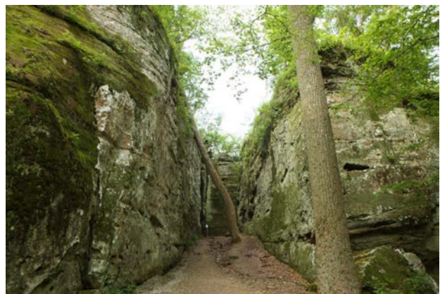
Crab Orchard National Wildlife Refuge is only 7 miles from Herrin.